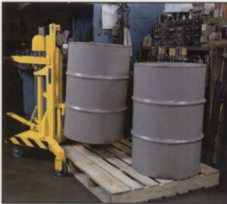
Compact profile for tight work spaces