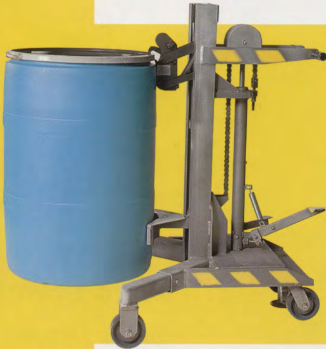
All models available with optional Steel-It™ coating

Perfect for placing drums on/off wooden pallets... and spill containment pallets