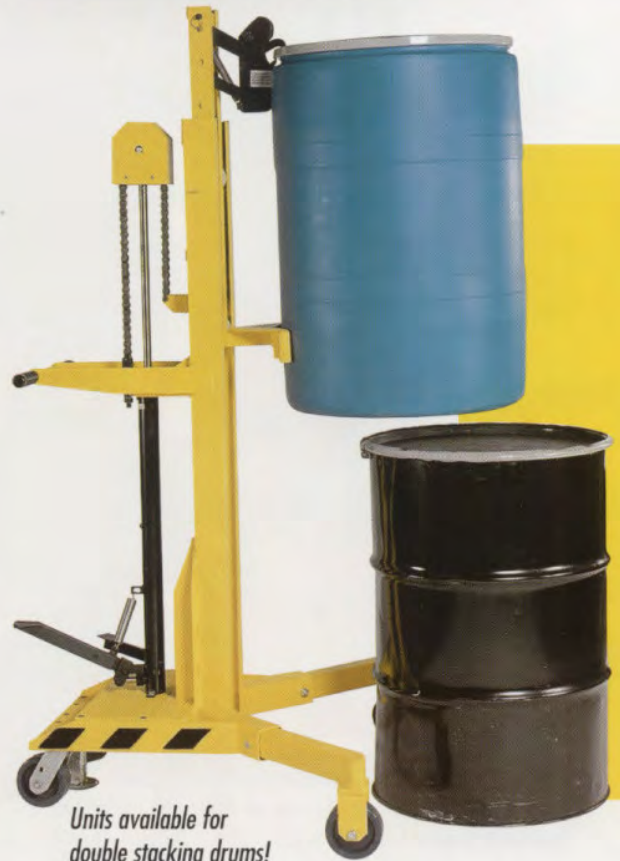
Units available for double stacking drums!